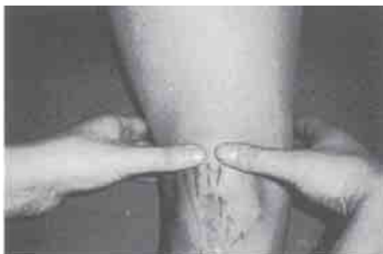
Fig. 10: Work with the scar using the pads of the thumbs or fingers.