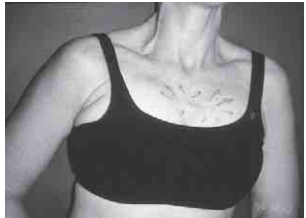
Fig. 2: Shown is the mapping done by the practitioner of the direction of the superficial lymphatic circulation. The melanoma scar is six months old.

It should also be noted that the lymphatic pathways can regenerate only one millimeter through fibrotic tissue →