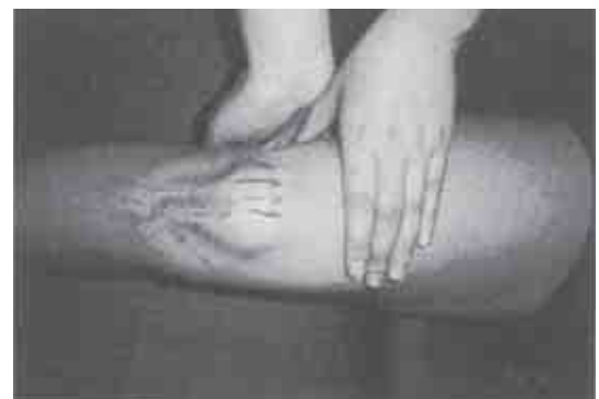
Fig. 9: The practitioner continues to work the lymphatics retrograde on the capillaries and collectors of the thigh. In this way, he creates a vacuum action, affecting the lymphatic circulation in the scar area as documented by Pecking, France.