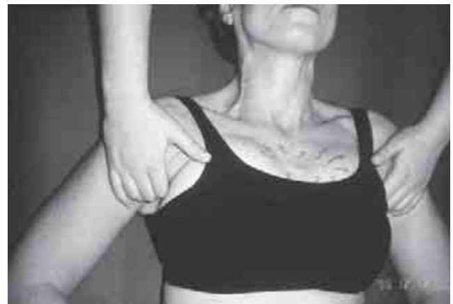
Fig. 3: This method stimulates the axillary nodes bilaterally