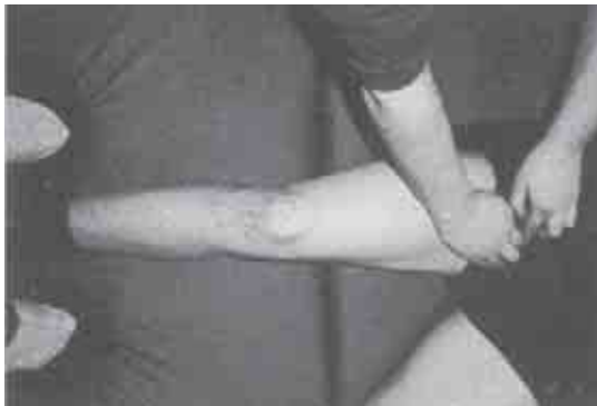
Fig. 8: Following the 10 points for maximum results, the practitioner works retrograde from distal to proximal. Here the practitioner is stimulating the flow in one of five locations of the superficial and deep inguinal nodes or "mother nodes." The mother nodes are the nodes responsible for the drainage of a specific lymph territory or lymphotome.