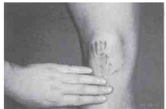
Fig. 11: The practitioner works proximal to distal, stimulating the lymphatic flow back to the inguinal nodes.