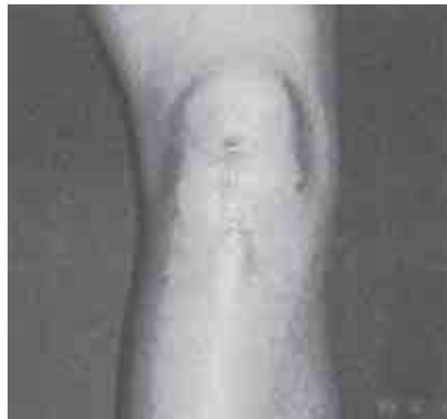
Fig. 6: The scar shown is 10 months post-surgery on the anterior cruciate ligament.