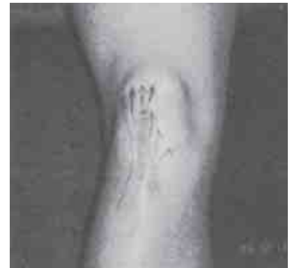
Fig. 7: The practitioner has mapped the direction of the superficial lymphatic circulation. This is done at the beginning of the first session, after the practitioner has checked for swelling, inflamed or painful areas.