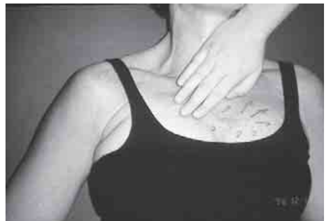
Fig. 4: Here, the practitioner uses local flat hand techniques to monitor the quality, direction and depth of the lymphatic flow, as well as to stimulate its rhythm.